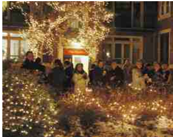
South Campus RHA held a winter lighting event Tuesday to unite residents and benefit holiday charities

With echoing cheers, warm cider and hot chocolate, the Boston University Residence Hall Association illuminated the trees and shrubs in Audubon Court during its annual South Campus Residence Hall Association winter lighting